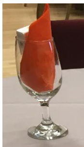
6.5 oz Wine Glasses