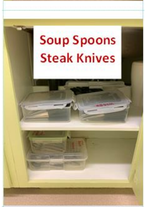
Soup Spoons Steak Knives