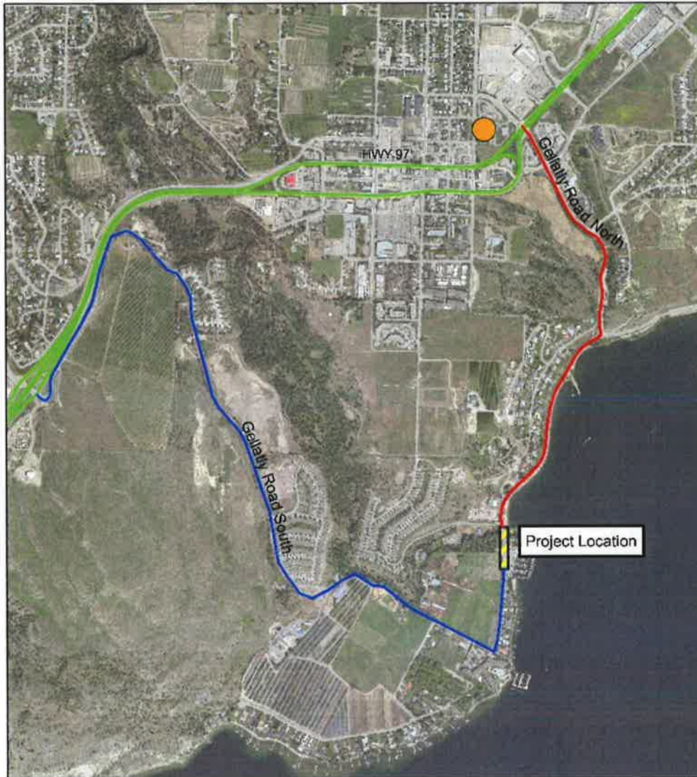
Illustration 2: Traffic Detour Map – Gellatly Road Bridge Closure 2020

City of West Kelowna 2760 Cameron Road, West Kelowna, British Columbia V1Z 2T6 Tel (778)797.1000 Fax (778)797.1001