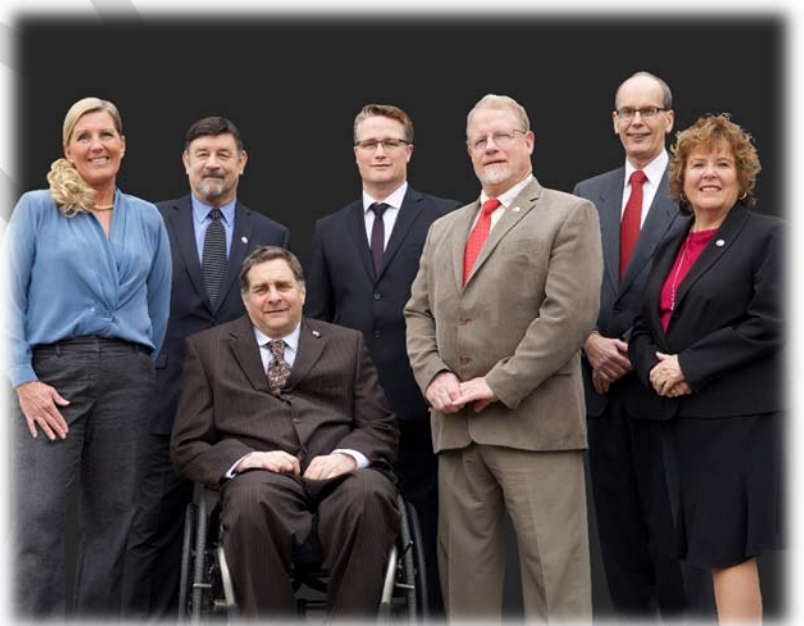
CITY OF WEST KELOWNA COUNCIL 2014-2018

The City of West Kelowna is an innovative local government that will make informed decisions to benefit the community by welcoming input and giving consideration to fiscal responsibility, environmental stewardship, healthy living and economic enhancement.