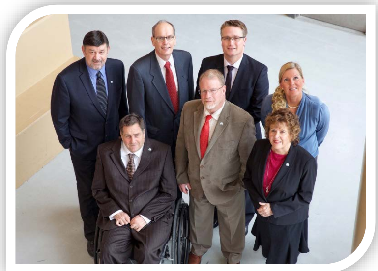
City of West Kelowna Council 2014-2018

The City of West Kelowna is an innovative local government that will make informed decisions to benefit the community by welcoming input and giving consideration to fiscal responsibility, environmental stewardship, healthy living and economic enhancement.