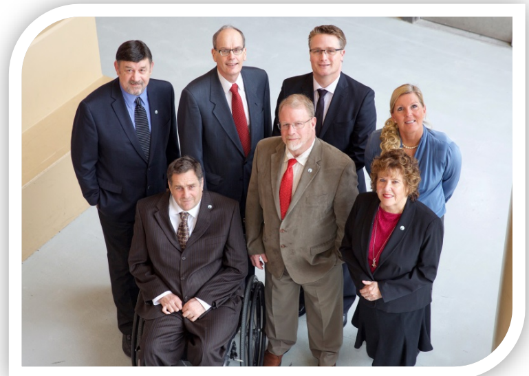
City of West Kelowna Council 2014-2018

The City of West Kelowna is an innovative local government that will make informed decisions to benefit the community by welcoming input and giving consideration to fiscal responsibility, environmental stewardship, healthy living and economic enhancement.