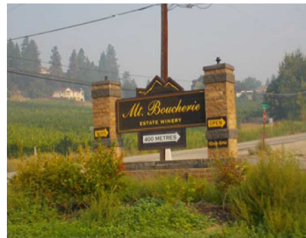
Ground-oriented, freestanding sign